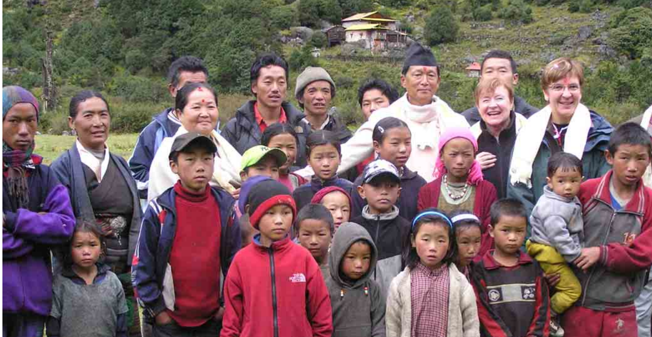
In Ghunsa, 23 September 2006