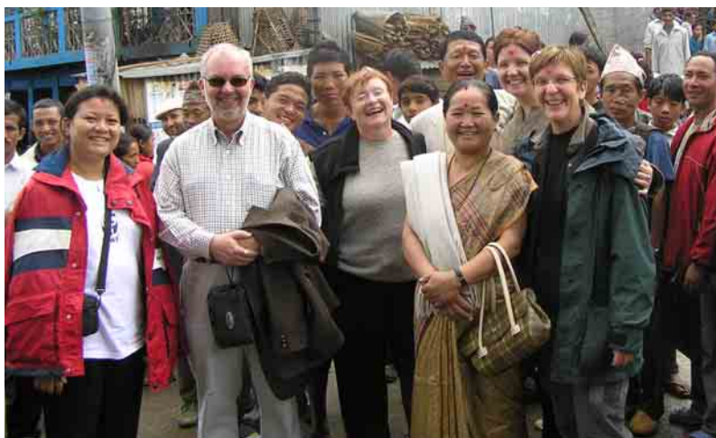
At the 'haat', the local market in Phungling