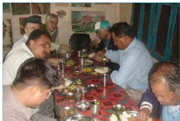
Having lunch in Okhaldhunga

I came back to our office, had lunch and visited the bazaar to buy a few gifts for my son, knowing that the first thing he will do after my arrival will be to open my bag and innocently demand, "What have you brought for me?"