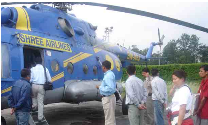
Boarding the helicopter

Finally, amongst the grand ceremony in Kangchenjunga, the Conservation Area was handed over by the Government of Nepal to the local community for its management.