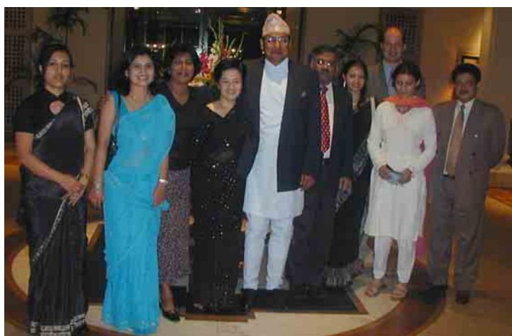
With staff on the 10 th WWF Nepal Anniversary, 2003