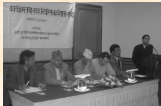
Inaugural ceremony: Target setting workshop for TAL Business plan

The core team for the formulation of Strategic Plan for Terai Arc Landscape organized a one day workshop to set the 10 year Biological and Social targets and to verify unit cost and activities for the development of Business Plan for TAL - Nepal. The workshop was participated by the representatives of various key partners currently active in the TAL area. Formulation of a Business plan for TAL- Nepal is a mandatory step