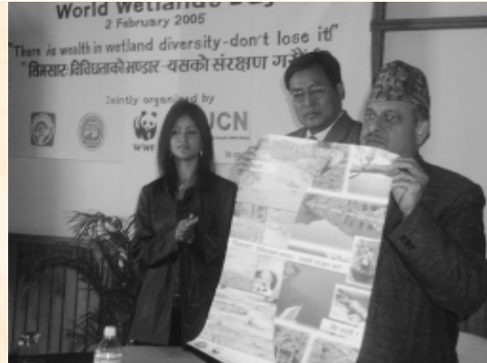
Secretary of MFSC (right) releasing the Wetland Special poster