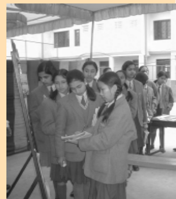
Students observing the Exhibition stall at Baba Boarding School

WWF Nepal Program participated in an Exhibition at Baba Boarding School on 17 and 18 February 2005. Posters and publications were distributed to the students at the exhibition, participated by more than 1000 students.