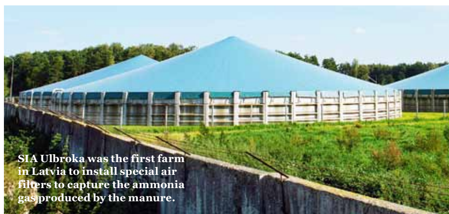
SIA Ulbroka was the first farm in Latvia to install special air filters to capture the ammonia gas produced by the manure.