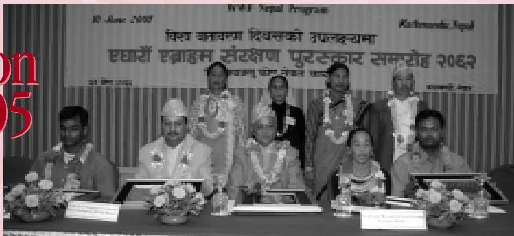
Abraham Conservation Awardees

A braham Conservation Awards were presented by WWF Nepal Program to five institutions and three individuals for their outstanding contribution to biodiversity conservation, conservation education and sustainable development at a ceremony in Kathmandu on 10 June 2005.