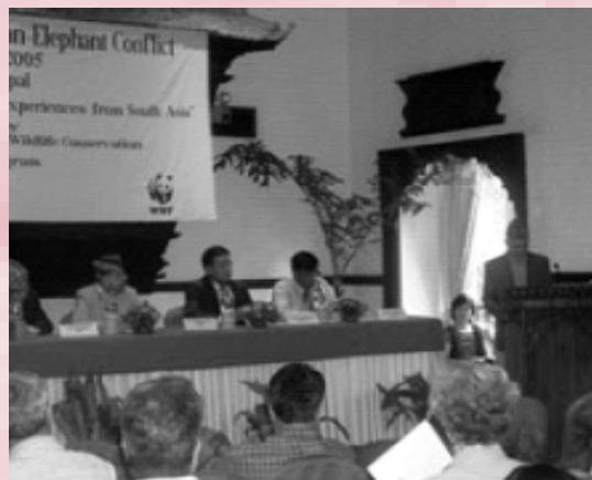
Participants at the "Human Elephant Conflicts: Lesson and Experiences from South Asia" workshop

The conference was also very useful for countries like Nepal, where human-elephant conflict issues are emerging, and government and NGOs are developing strategies to address human-elephant conflict.