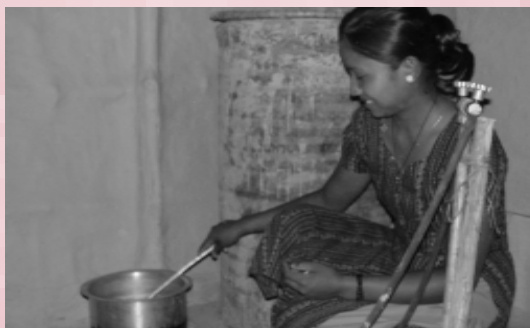
Member of Kalpana Women's group, Bardia, using biogas in her kitchen

The Improved Cooking Stoves (ICS) distributed to 1003 households in New Padampur VDC, Chitwan, have made locals healthier and happier. Local women are especially pleased that ICS not only saves time and energy but also improves their health. ICS play an important role in reducing fuel wood consumption and in Padampur, will reduce the pressure on the nearby Barandabhar forests. The effective installation of 795 ICS was monitored jointly by the Women Income Generation Group and Development Concern Society, Padampur. Of the 1003 households, 47.3, 51 and 1.7 were Terai, hill migrants and Dalits respectively. The installation was supported by WWF NP's Terai Arc Landscape (TAL) program.