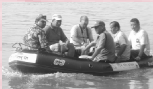
The recently handed over motorboat at Rapti river