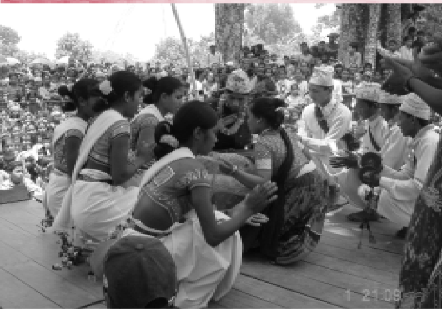
Community Forest Coordination Committee members performing cultural dance on the World Environment Day