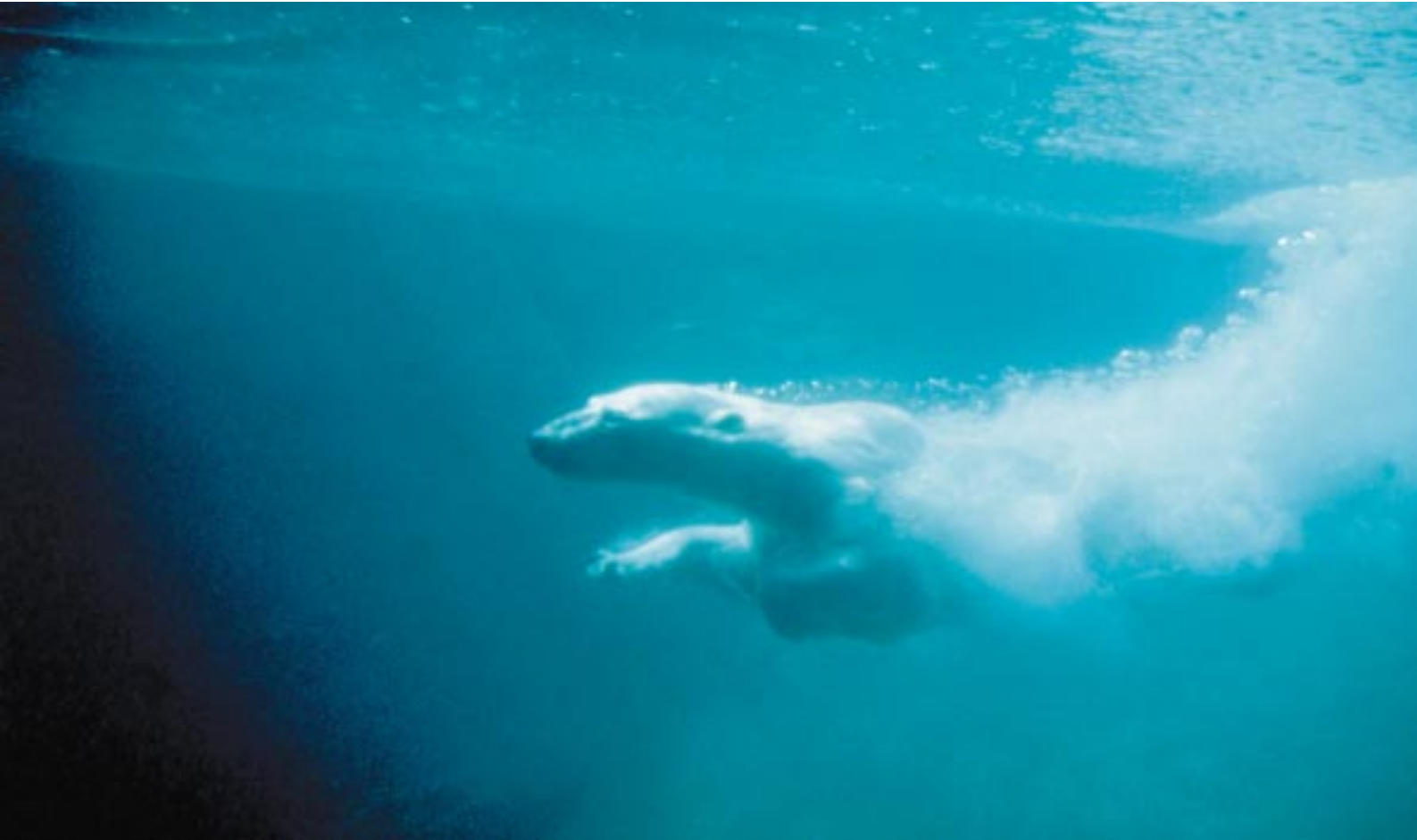
Ursus maritimus Polar bear diving, Hudson Bay, Canada.

commercial hunting but now a new threat is emerging. We must do all we can to understand how climate change is affecting polar bears in the Arctic in order to be able to do what we can to enhance their chances of long-term survival.”