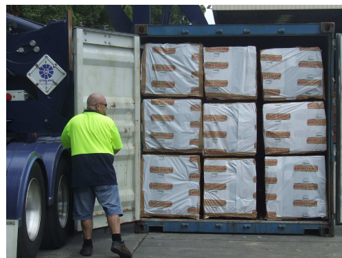
“DNA Lumber” arrives at Simmonds Lumber

The technology has been developed by Certisource, a Singapore based timber auditing company, who have been working with Simmonds Lumber for the last 5 years.