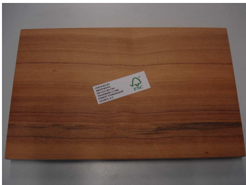
Back of award with FSC logo