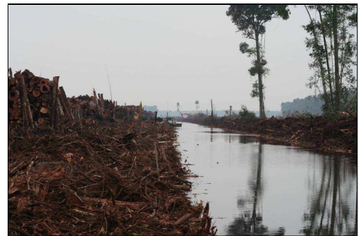
Natural forest wood piled along a peat swamp drainage canal in Riau Province, Sumatra now used for floating the timber © WWF Indonesia.

In the past, APP had pledged to protect few small blocks of high conservation value forests (HCVF). However, according to SmartWood, which was hired by APP to audit its performance in protecting these HCVFs, APP failed to protect them. In a meeting with WWF in June this year, APP then refused to guarantee that HCVF would be excluded from its future logging and wood sourcing operations.