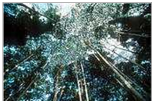
The WWF–Danzer Group cooperation aims to promote sustainable forest management in the Congo Basin.

WWF has been active in the Congo Basin for many years and has worked to establish and oversee protected areas that provide safe habitats for endangered species such as gorillas, forest elephants and other wildlife in the region, as well as promote responsible forestry for the benefit of national economies and livelihoods of local communities. Despite their importance, the Congo's forests are threatened by illegal and destructive logging, poaching and smuggling of wildlife, and the illicit bushmeat trade.