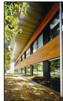
RAAF Richmond (5 Star Green Star - Office Interiors v1; 5 Star Green Star - Office Design v1; 5 Star Green Star - Office As Built v1 (awarded the Sustainable Timber credit for all 3 ratings)

"This Report confirms what the Green Building Council already knows - green buildings are no longer just the future of the industry, they are today's reality, and the Green Star environmental rating system is becoming the green building standard of the industry," said Green Building Council Chief Executive, Romilly Madew.