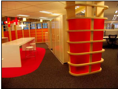
Investa Fitout at Level 6 & 7, 126 Phillip, Sydney (5 Star Green Star - Office Interiors v1)

growing international and local evidence shows that the industry should not expect the cost to build green to exceed a 3% premium - which makes the green premium for a green CBD commercial building less than $100 per sqm." BCI Australia CEO, Dr Matthias Krups, said the results showed the momentum in the industry to build green.