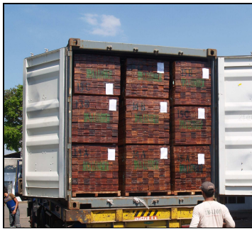
DNA Lumber being loaded for Simmonds

In Indonesia this resulted in Seng Fong signing up as an FTN member with other major suppliers expected to join soon.