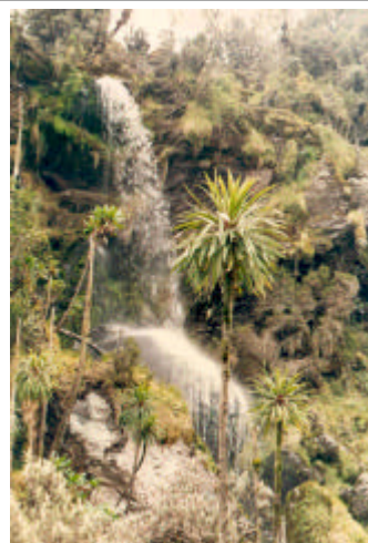
Waterfall in the Ruwenzori, part of two key protected areas in the Albertine Rift: Virunga National Park and Ruwenzori National Park

Tel: 254 02 572630/1 or 577355; Fax: 254 02 577389