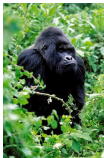
A male Mountain Gorilla in the Virunga volcanoes