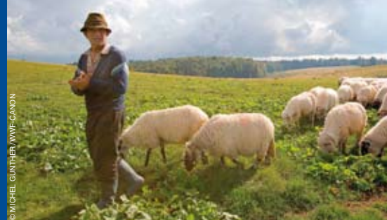
Shepherd, Gradistea Muncelului Cioclovina Nature Park, Romania