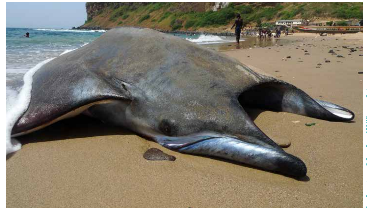
Devil Ray on beach.

The FAO expert advisory panel convened in 2016 to assess CITES proposals concerning commercially exploited aquatic species concluded that M. tarapacana and M. japanica are low productivity species, and that associated decline data meet the CITES Appendix II listing criteria.