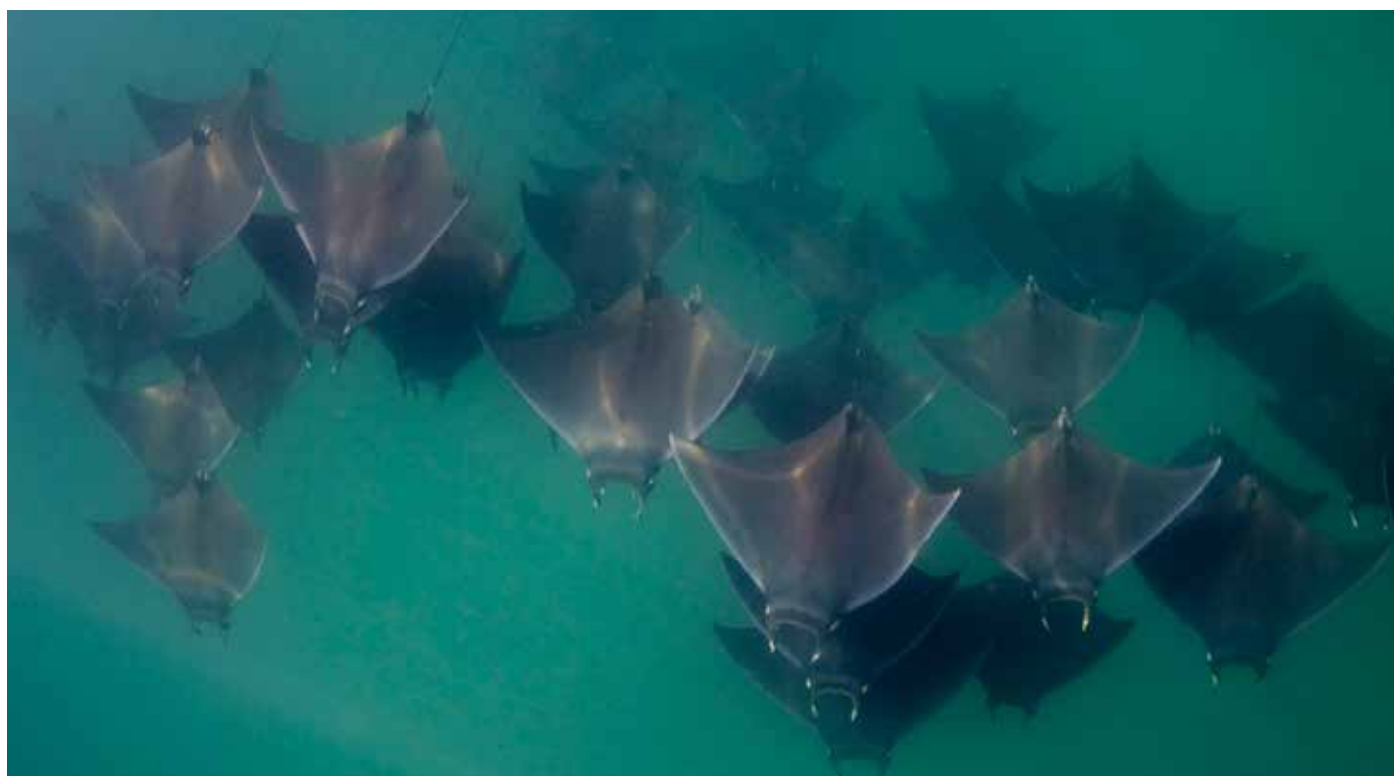
Mobula, Mexico.

Bahamas, Bangladesh, Benin, Brazil, Burkina Faso, the Comoros, Costa Rica, Ecuador, Egypt, the European Union, Fiji, Ghana, Guinea, Guinea-Bissau, Maldives, Mauritania, Palau, Panama, Samoa, Senegal, Seychelles, Sri Lanka, and the United States of America.