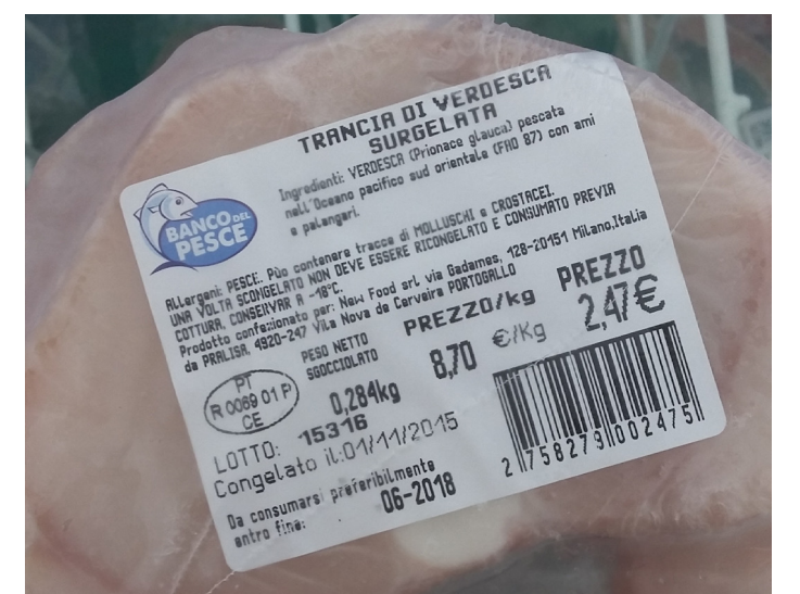
Frozen Blue Shark ( Prionace glauca) meat in a Milan, Italy retail outlet, caught using longline in FAO area 87.

As a result of this recommendation and discussions at SC66 in 2016 (SC66 SR, Para 34.), the Parties at CoP17 will consider adopting a Decision which directs, inter alia , the SC to recommend a definition of traceability, provide guidance on a governance structure, and develop umbrella guidelines and standards, all of which would be posted on the CITES website. Also, the draft Decision requests the SC to draft a Resolution on traceability for consideration at CoP18.