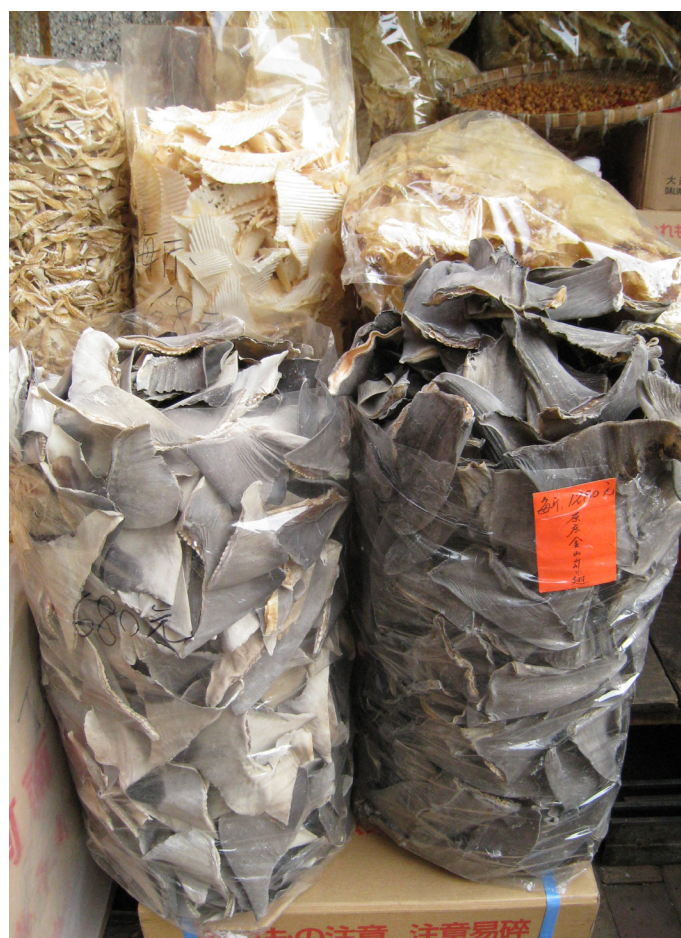
Dried shark fin in Hong Kong retail store. Red label on bag of fins reads Jin Shan Gou Fin (which means: gold mountain caudal fin).