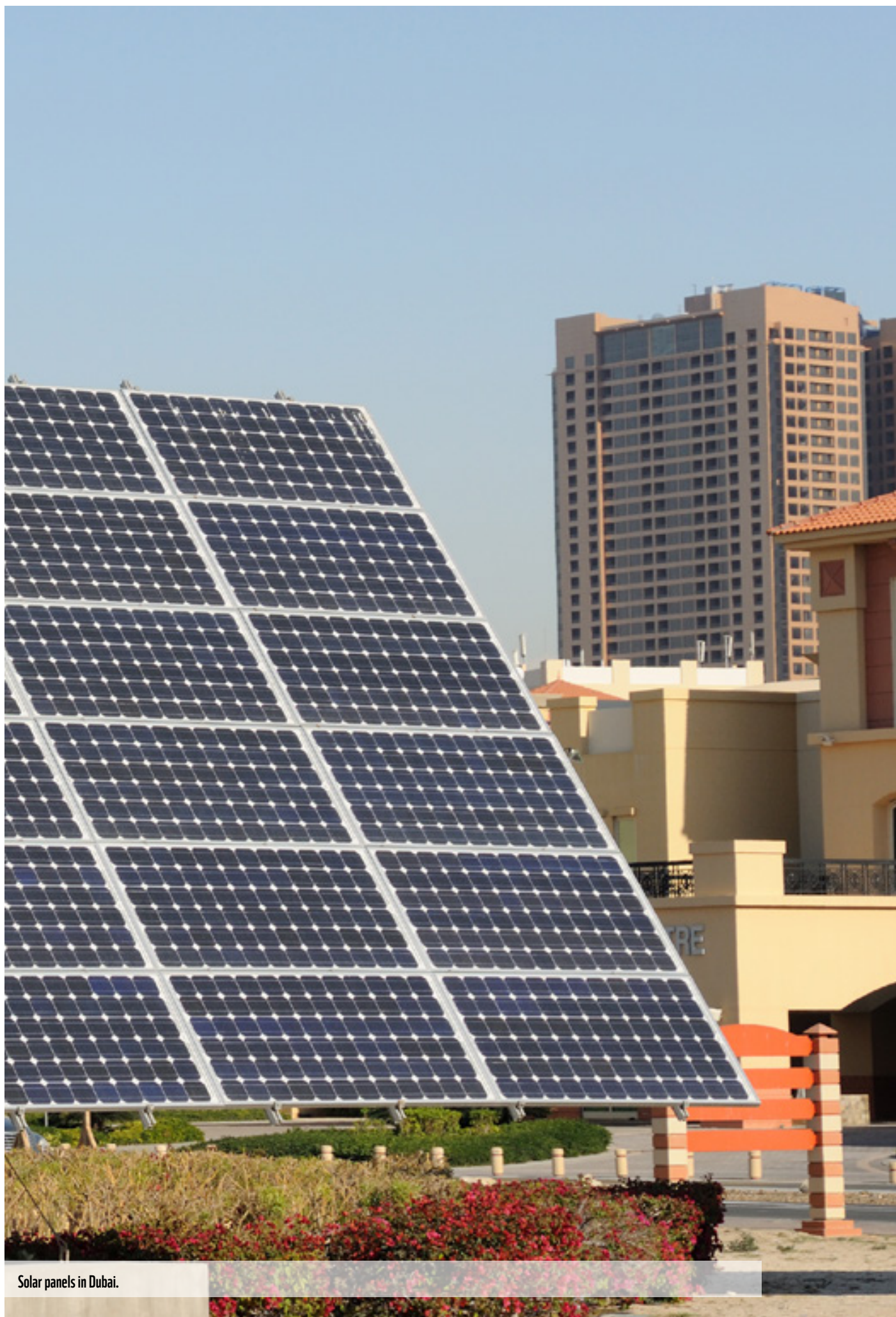
Solar panels in Dubai.