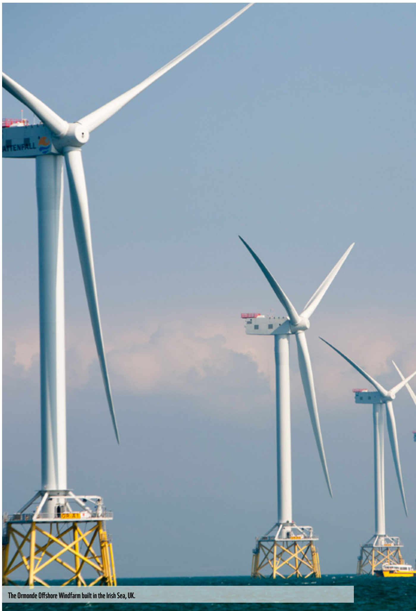
The Ormonde Offshore Windfarm built in the Irish Sea, UK.