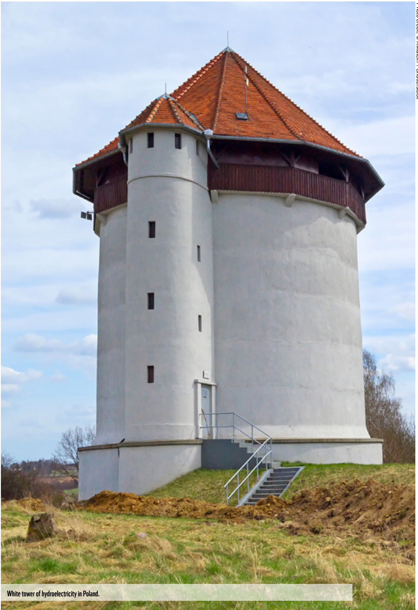
White tower of hydroelectricity in Poland.