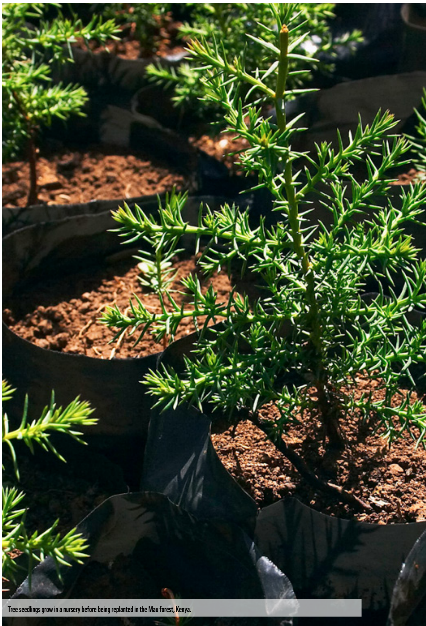
Tree seedlings grow in a nursery before being replanted in the Mau forest, Kenya.