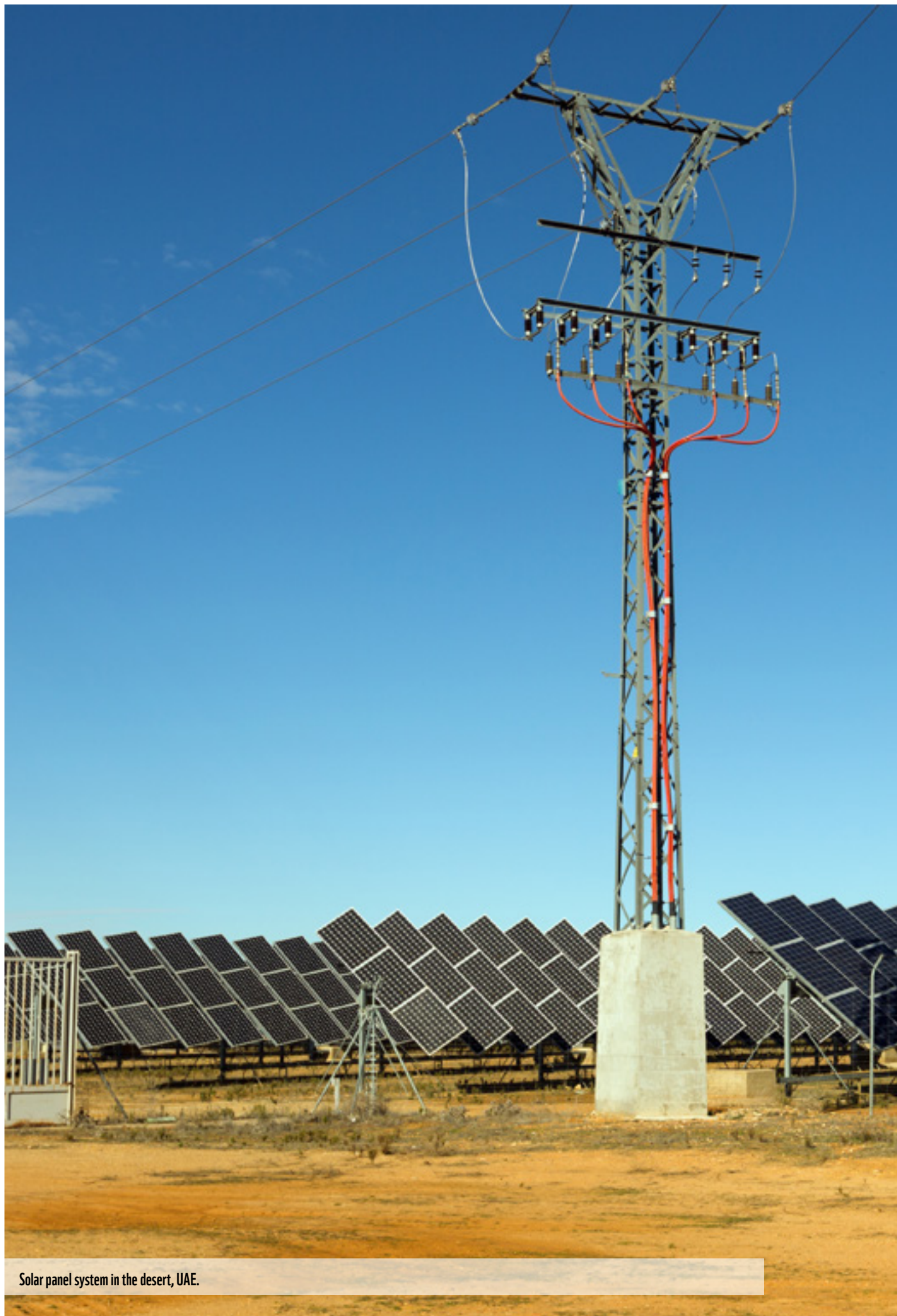
Solar panel system in the desert, UAE.