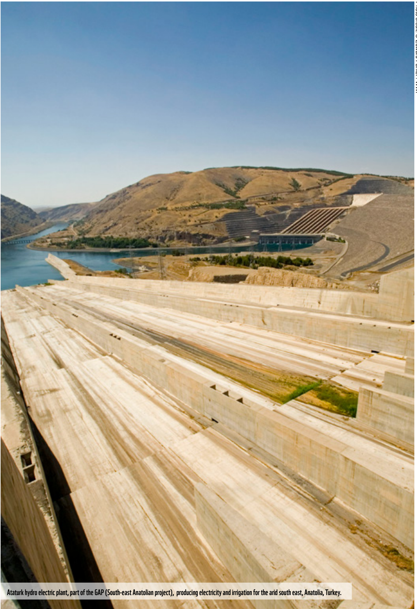
Ataturk hydro electric plant, part of the GAP (South-east Anatolian project), producing electricity and irrigation for the arid south east, Anatolia, Turkey.