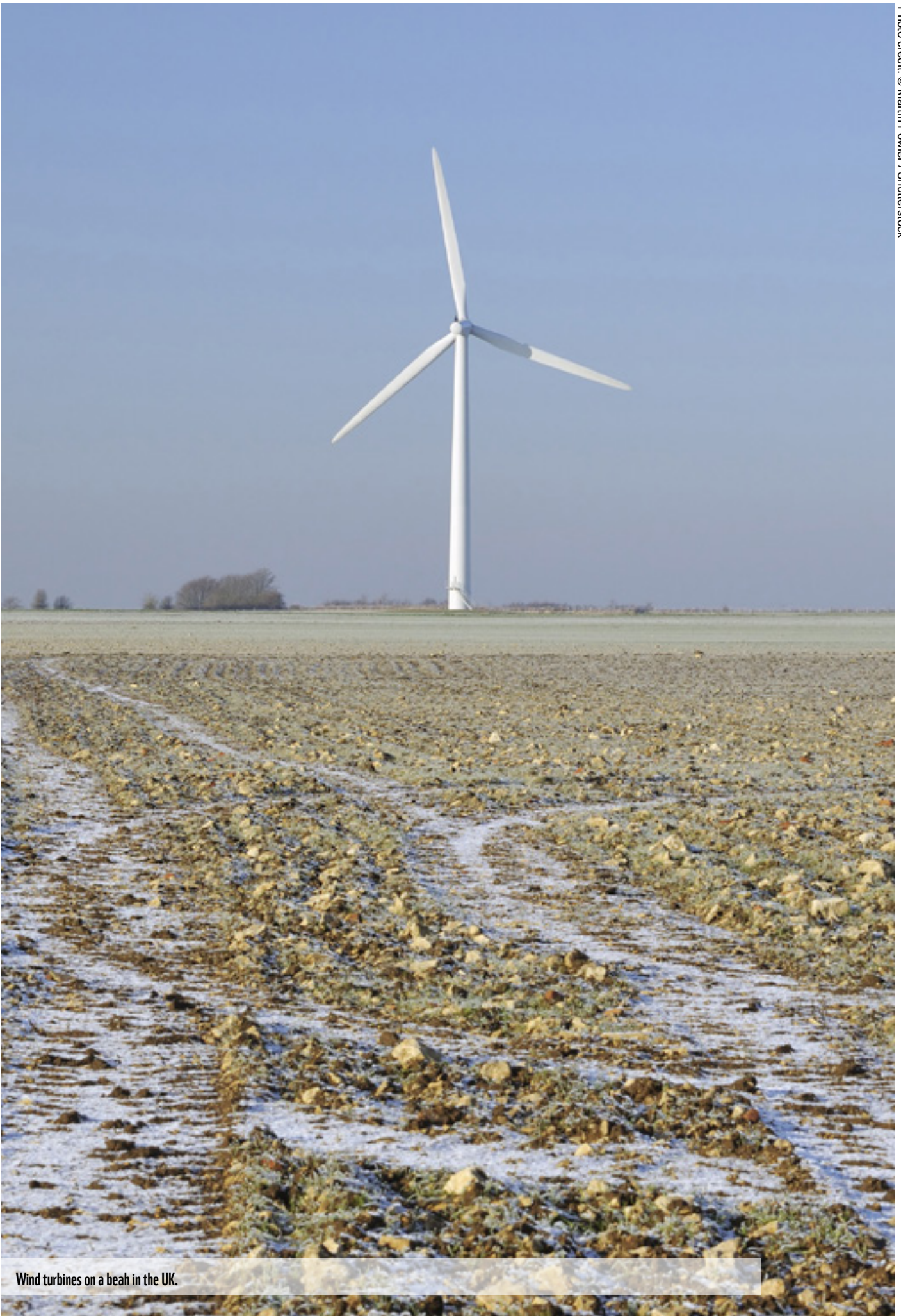
Wind turbines on a beach in the UK.