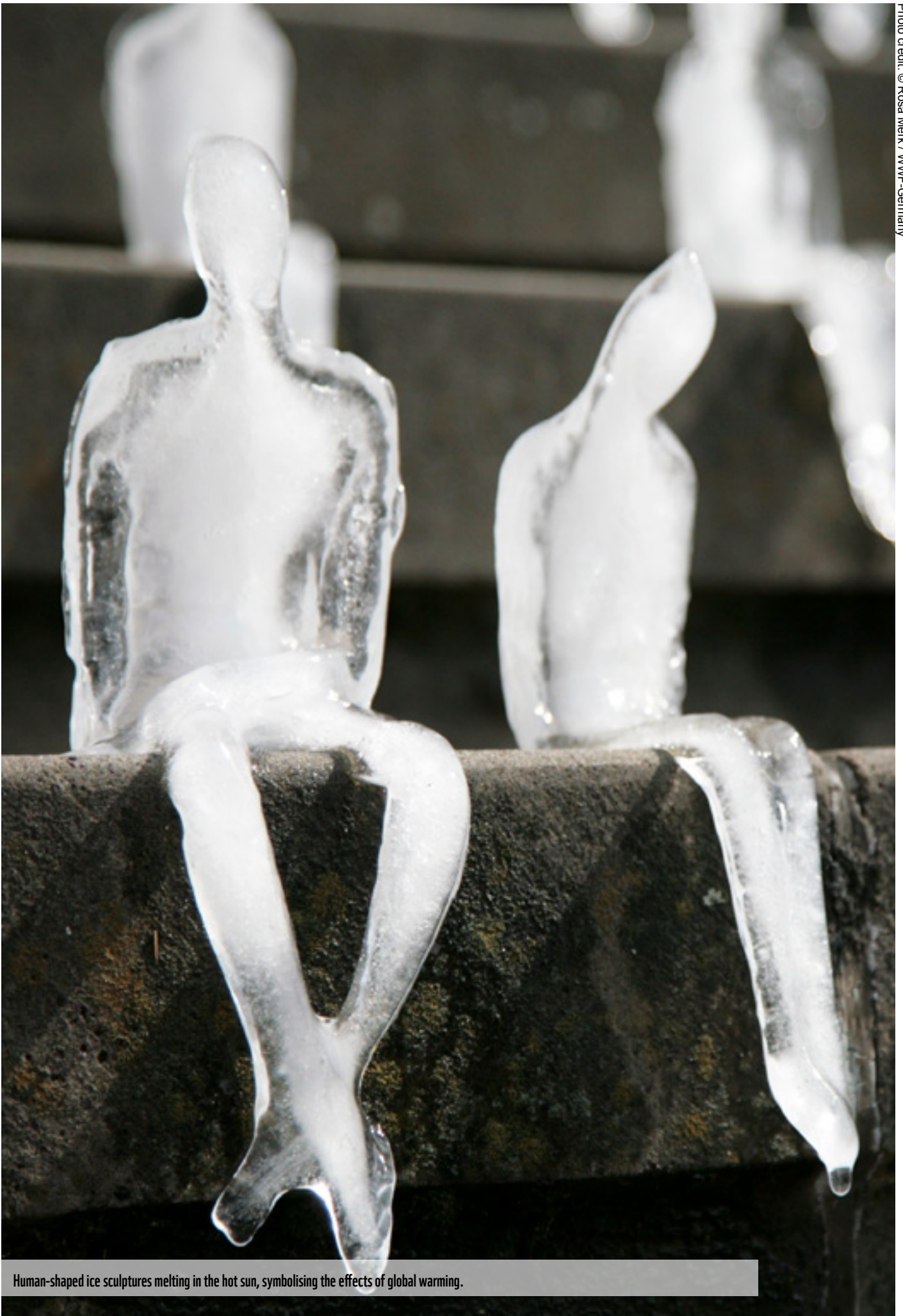
Human-shaped ice sculptures melting in the hot sun, symbolising the effects of global warming.