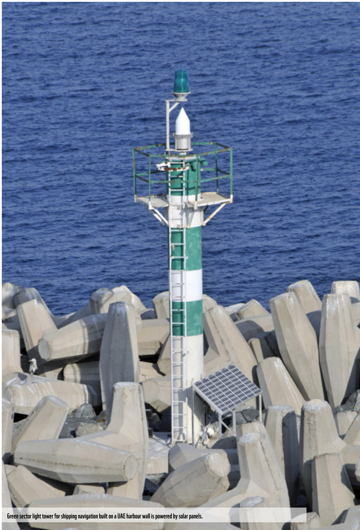
Green sector light tower for shipping navigation built on a UAE harbour wall is powered by solar panels.