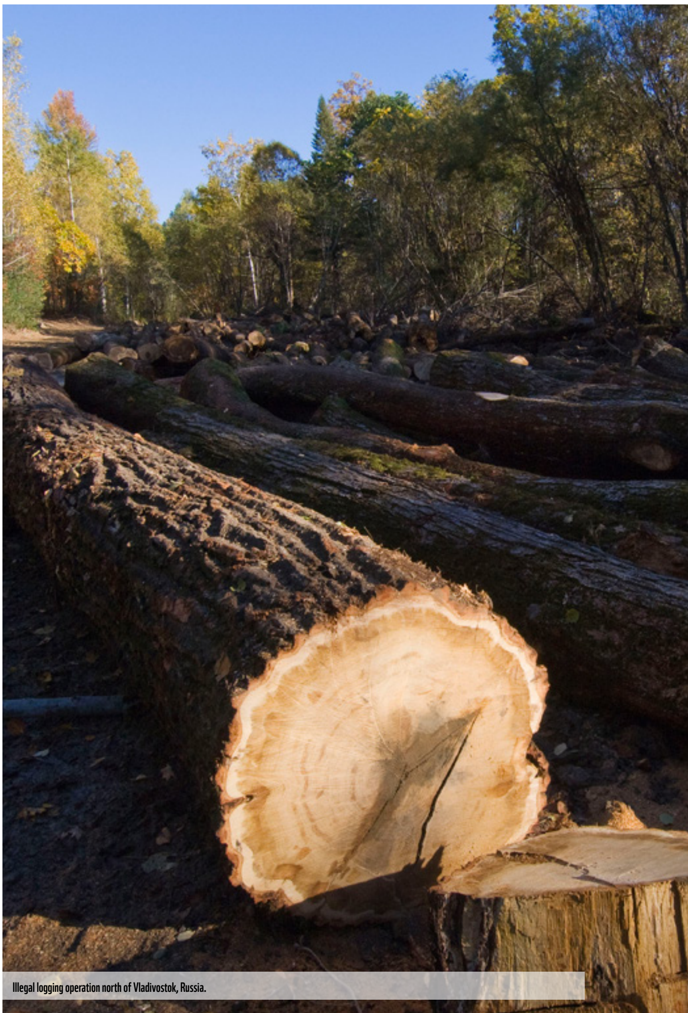
Illegal logging operation north of Vladivostok, Russia.