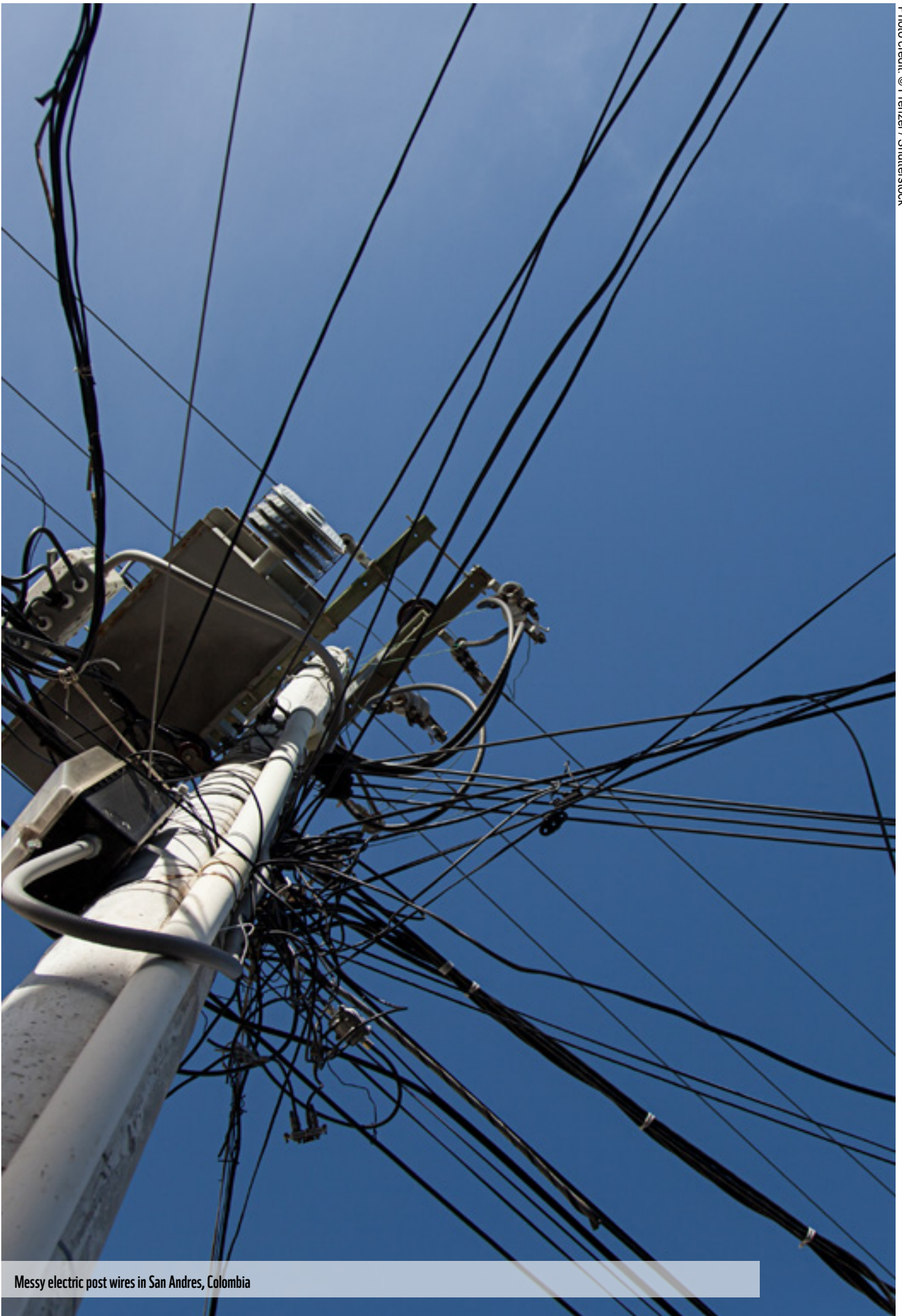
Messy electric post wires in San Andres, Colombia