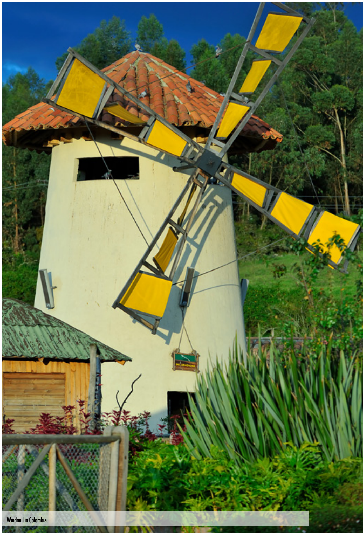
Windmill in Colombia