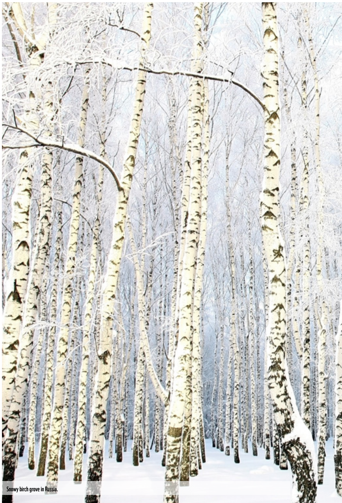
Snowy birch grove in Russia.