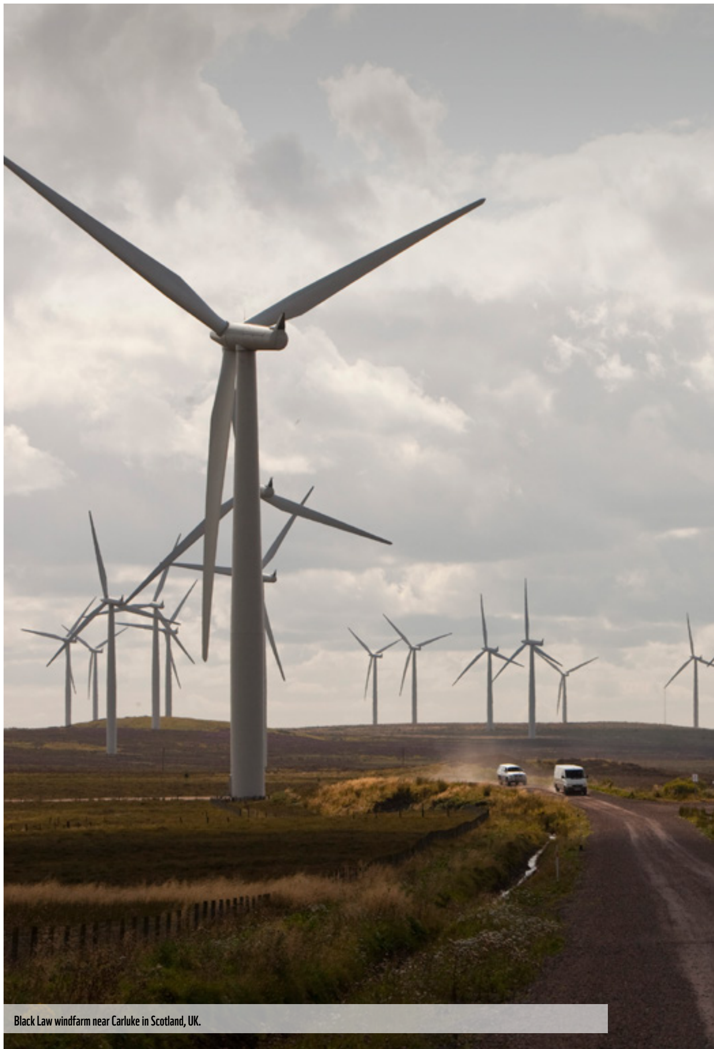
Black Law windfarm near Carlisle in Scotland, UK.