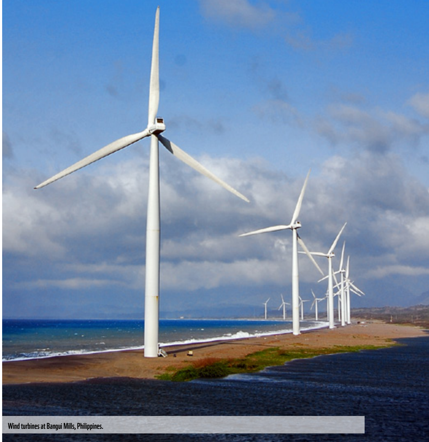
Wind turbines at Bangui Mills, Philippines.