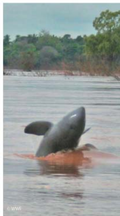
Adult Irrawaddy dolphin ( Orcaella brevirostris ), Mekong River