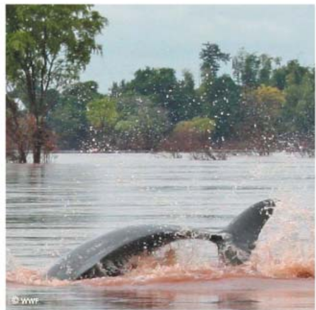
Irrawaddy dolphin, Mekong River.

For factor 4, construction-related impacts may involve short-term noise disturbance and increased stress to dolphins breeding or foraging in the proximity of the dam site (Table 1).