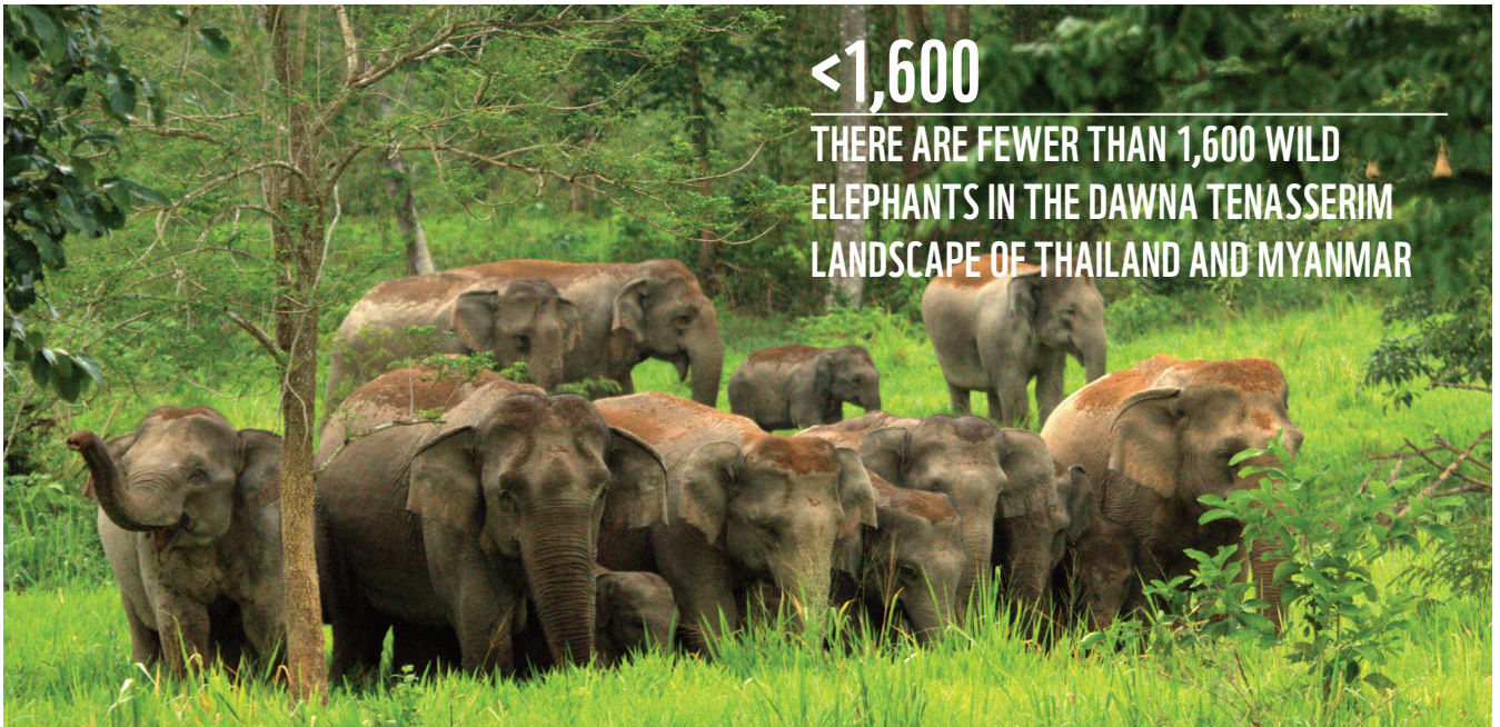
Wild elephants at Kuiburi National Park