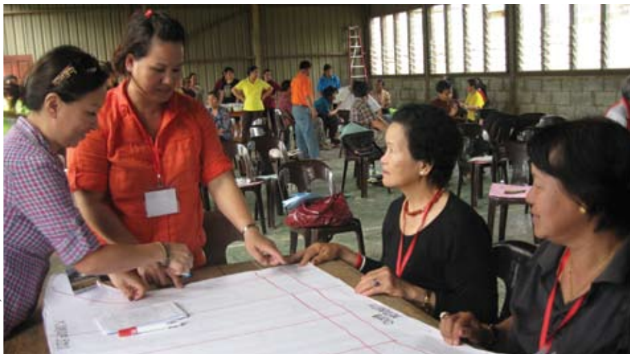
Active participation by women in the group discussion to identify products to be marketed under Green and Fair Products brand.

WWF's HoB Initiative has worked with government partners to ensure that the EIA process and certain environmental restrictions are included in the roll-out of the new spatial plans and zoning regulations under Indonesian Presidential decree. An important finding was that despite the massive increase in road infrastructure in West and East Kalimantan since 2000, only one EIA was completed. There are many challenges ahead in harmonising infrastructure development with environmental regulations; we will look to continue work with ADB to strengthen implementation of the HoB Initiative objectives.