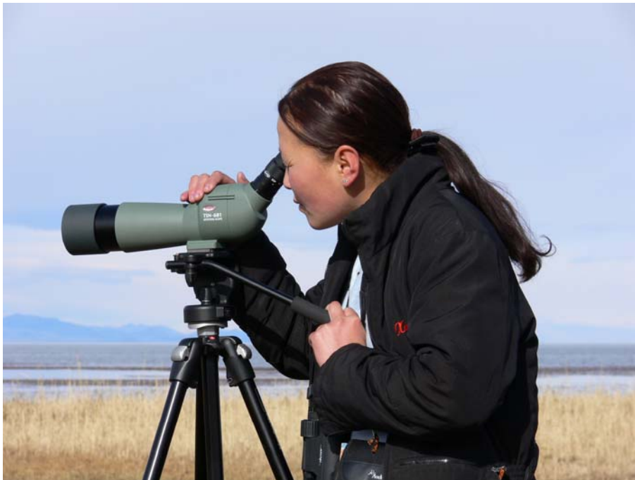
Struggling to identify all these distant ducks (and Coots)! South-eastern Khar Us Nuur National Park, October 2006.

The third field trip this year went again to the Tsagaan gol area in the southern part of Khar Us Nuur National Park. But this time the eastern side was visited. We slept in a ger (or yurt, the traditional felt tent of Mongolian nomads) and enjoyed the hospitality of the local people. The trip concentrated more on the identification of birds, rather than surveying a large area. Highlight of the trip was the observation of three Dalmatian Pelicans which were flying high above the adjacent Jargalant Khaikhan Mountain (part of the National Park) with its Snow Leopards.