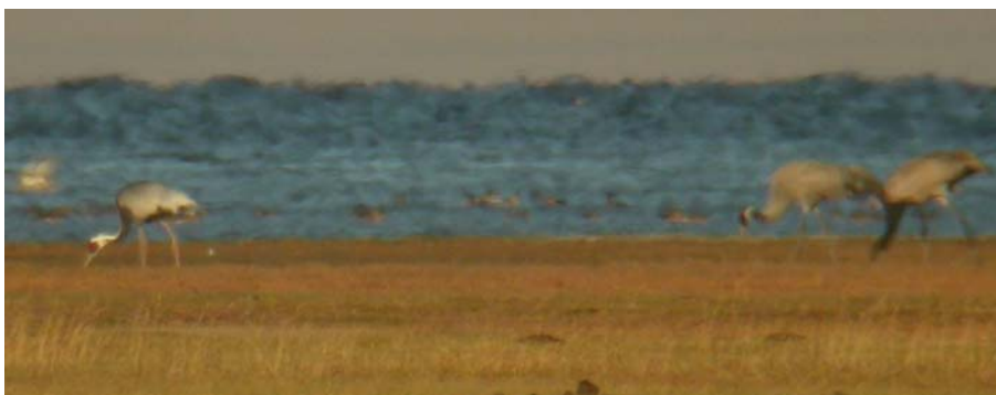
Western Mongolia's second Whited-naped Crane (left, with Common Cranes to the right) was observed at Airag nuur during the AWCF-sponsored tour.