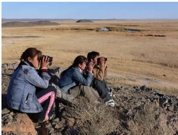
HUN Club members observing Eurasian Spoonbills and other waterbirds at Schar nuur in Khar Us Nuur National Park. September 2006.

Apart from bird watching a Sumo- and traditional Mongolian style wrestling competition added to the fun of the trip. On the way back we stopped at Khar Us Nuur (see next photo).