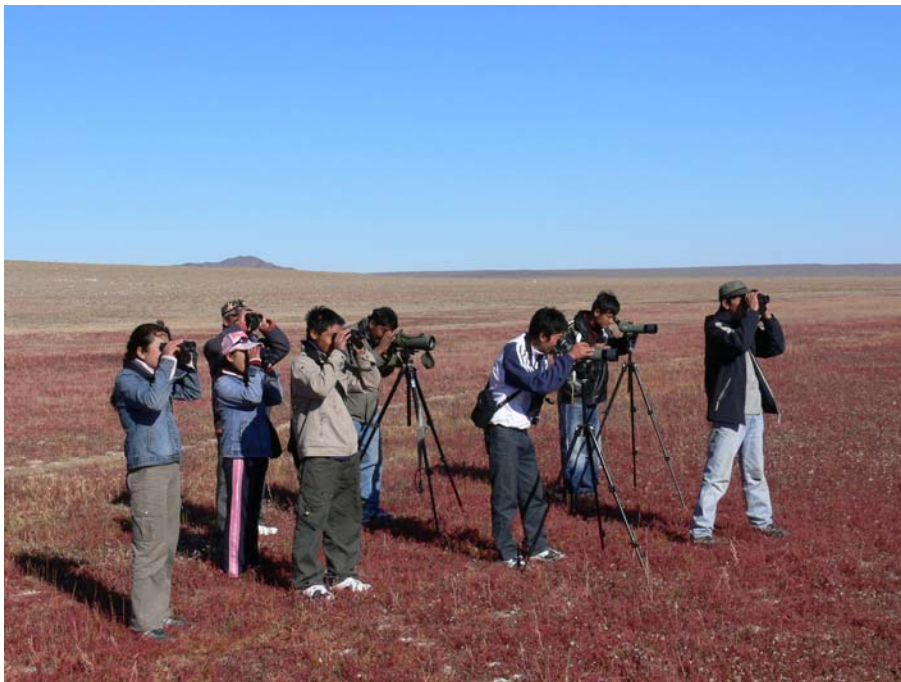
A group of students and teachers from Khovd State University, members of HUN Club, at the lake Airag nuur, one of Mongolia's most bird-rich wetland reserves (IBA & Ramsar site). September 2006.

Participants: 9 people (students 4 male, 2 female, biology teacher from Khovd State University [different teacher from July] 1, biologist from the KUNNP Administration 1, adviser to WWF Altai-Sayan Field Office 1, officer from Anti- Poaching Unit 1)