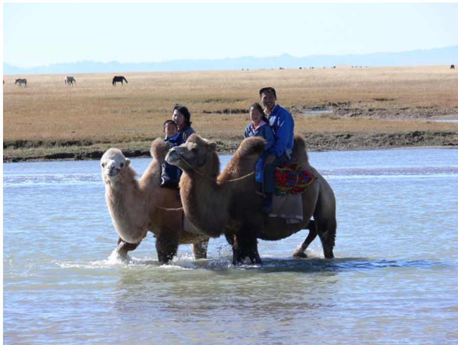
Local herders, interested in our activities, cross a river to reach our field camp. Airag Nuur, September 2006.

This trip was a bit longer. We visited Airag nuur, a 143 km 2 (14,300ha) lake at 1030 m.a.s.l. to the north of Khar Us Nuur National Park. The lake is an IBA and Ramsar Site and is part of the Khan Khokhij - Khjargas Nuur "A" National Park. A roost of 11,000 Cormorants, hunting Pallas's Fish Eagle, Golden Eagles, White-tailed Eagles and a White-naped Crane, only the second for western Mongolia (see photo) were unforgettable sights. We camped at the edge of the lake and got visits from local herdsmen.