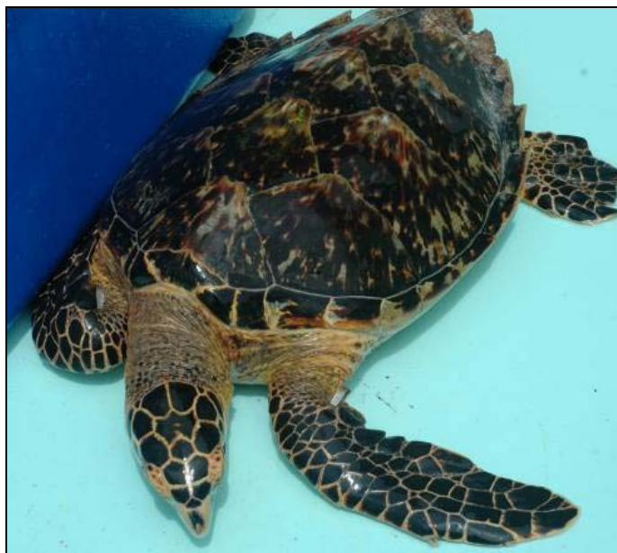
Hawksbill turtle showing flipper tag in anterior left flipper.