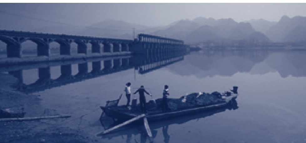
Yanzhou hydro-power station on the Lishui River Hunan Province China Project number: CN0088

While the initial cost of building the dam may be huge, other recurring costs can also be an important part of the financial equation. In general, the running costs of the dam itself are relatively well understood. They include hiring staff for operations and maintenance and the cost of maintenance materials. What is often less well understood are the maintenance and operating costs associated with the benefits the dam is intended to provide. Typical costs associated include new distribution and drainage channels for irrigation and new power lines and transformers for hydropower. Further, all dams become increasingly expensive to maintain in a structurally sound state as they age.