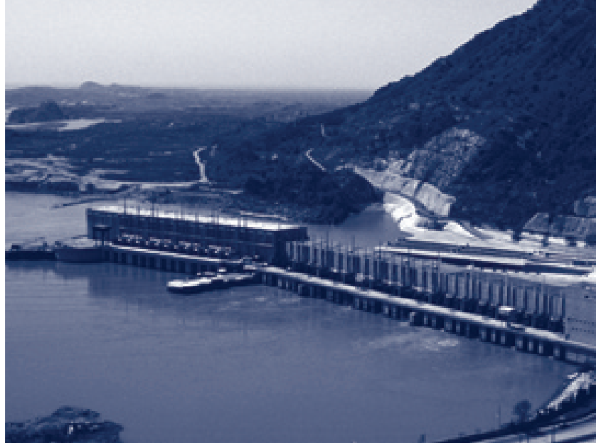
Tarbella hydroelectric power plant, Pakistan.