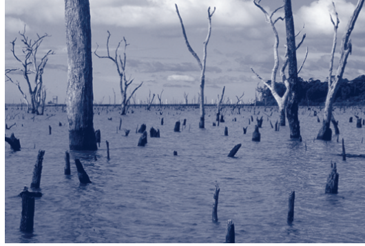
Dead trees drowned by Itaipu lake created by the dam in the Atlantic rainforest