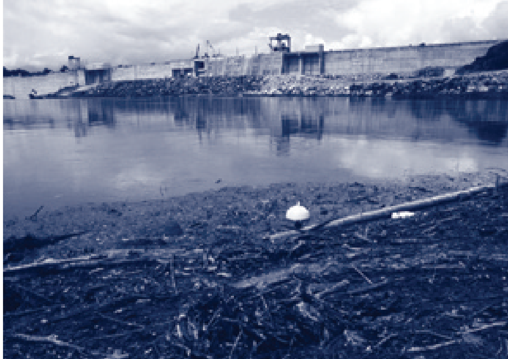
Recovery of dead wood obstructing Petit Saut dam, French Guyana.