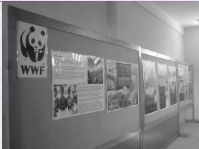
WWF NP Displays at International Mountain Museum

► MOU signed between WWF Nepal Program and Alternative Energy Promotion Center Contd. from page 1