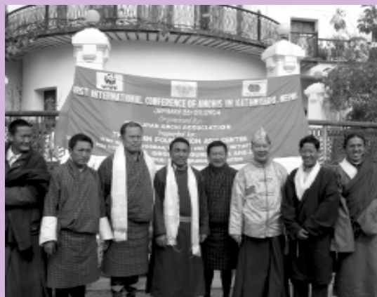
First International Conference of Amchis

The First International Conference of Amchis in Nepal was held from 25-29 January 2004. The Himalayan Amchi Association organized the workshop with the support of the Japan Foundation Asia Center, WWF Nepal Program/People and Plants Initiative, Drokpa Foundation, Jaiti, and Himal Asia. The recommendation of the workshop include providing traditional education, conservation, cultivation and sustainable utilization of medicinal plants, and international networking.