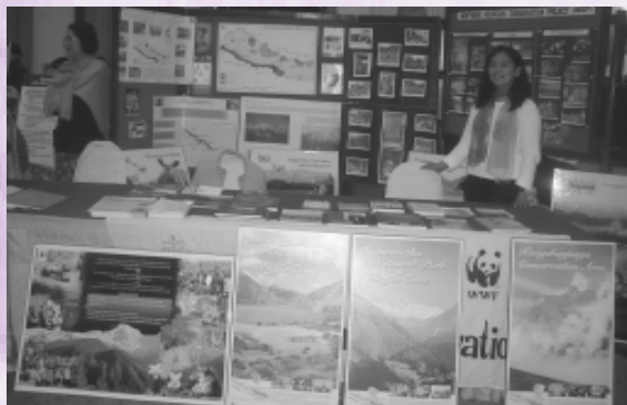
WWF NP taking part in Peace Corps Nepal All Volunteer Conference Fair

WWF Nepal Program participated in a Peace Corps Nepal All Volunteer Conference NGO/INGO Fair on 13 January 2004. The fair was not only helpful in disseminating WWF NP educational materials but also in providing an opportunity to talk directly with volunteers about the services and resources available through WWF NP.