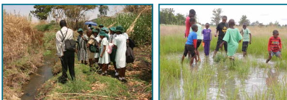
Left: Students from Marlborough School visit. Right: Members of the COSMO Kids Club enjoying the wetland.

Historically this site has been appreciated for its critical ecological function in the hydrological system of this catchment. Educational values are important culturally, with guided school visits and the long standing weekly COSMO Kids Club ongoing. The area is frequented by walkers and local, regional and international bird watchers. BirdLife Zimbabwe and COSMO carry out monthly bird walks Universities and colleges use the Vlei for research activities. Residents derive benefits from this Vlei in the form of recreation, appreciation of nature, this being a renowned wetland botanical and wildlife sanctuary.