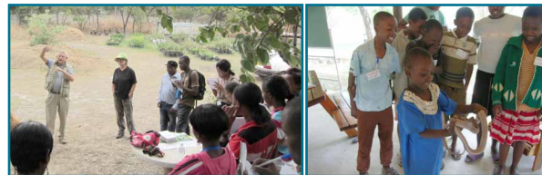
Left: Planning students from the University of Zimbabwe visit Monavale. Right: COSMO Kids Club learn about snakes from the vlei.

COSMO has engaged the expertise of local botanists, mammologists, ornithologists, soil scientists, hydrologists and geologists to document the biodiversity of the Vlei. Many workshops, field trips and conferences were held to make all stakeholders aware of the value of wetlands and water. The Monavale model has assisted in changing the mindset of Harare's residents in favour of urban wetlands and has been adopted for other urban wetlands such as Marlborough. A powerful and invaluable conservation tool has been to employ a vlei scout to monitor the biodiversity, counter threats and guide visitors.