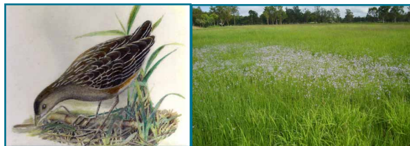
Left: The flagship bird species Striped Crake. Right: Lapeirousia erythrantha.

For more information on The Ramsar Convention or Monavale Vlei contact: