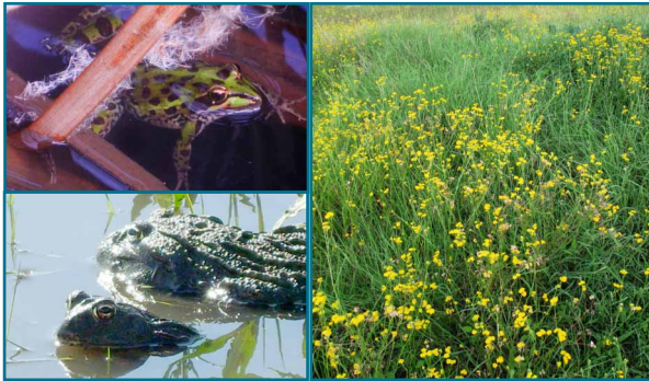
Left top: Common River Frog Left bottom: Giant Bullfrog Right: Nidorella auriculata flowering in the vlei

Owl, Giant Bullfrog or Mongoose? It is astonishing how many animals are found 3 kilometers from the city centre – Bushpig, Cape Clawless Otter, Large Grey Mongoose, Common Duiker, Giant Rat, Scrub Hare and sixteen reptiles of which three snakes, the Egyptian Cobra, Olive and Three-striped Grass Snake are the commonest. Living in puddles and pools on the Marimba River are 7 amphibians including The Giant Bullfrog (regionally endangered) that eat the numerous insects, tadpoles and fish such as Barbs, Barbel and Catlets.