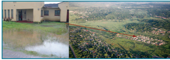
An aerial view of Monavale Vlei showing the location of a flooded house in Mayfield Estate

The threats to Monavale Vlei are: construction developments; dumping of wastes and rubbish; fires; stray dogs; illegal farming; alien plants; and loss of biodiversity. Upstream land use changes from wetland ecosystems to infrastructural developments are also a threat to the site. Increased awareness on the importance of Harare's wetland rich biodiversity for the ecological underground and surface water is required as well as coordinated protection of Monavale and other urban wetlands.