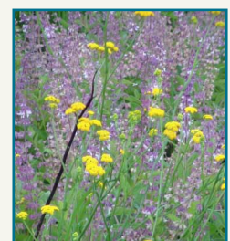
Left: The Streaky-Breasted Flufftail. Right: Nidorella auriculata (yellow) Orthosiphon schimperi (purple and white)