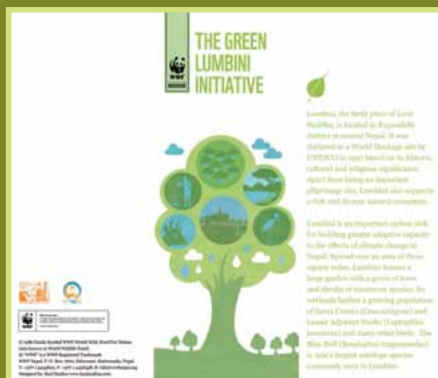
The Green Lumbini Initiative