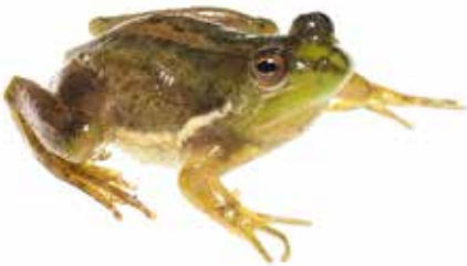
Guyana harlequin frog ( Lysapsus laevis ). This olive-green frog lives in the open flooded savannah area and is abundant in the southern Rupununi.

In the last two decades an alarming number of amphibian extinctions around the world have happened because of habitat destruction, disease and global climate change. Therefore, conserving areas which provide habitat for many species of amphibians such as the south Rupununi savannah is important for the survival of these sensitive animals.