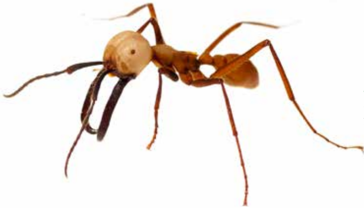
Army ants ( Eciton burchellii ) are swarm raiding predators that live in large nomadic colonies.