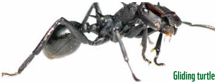
Gliding turtle ants ( Cephalotes atratus ) can glide to their home tree if they fall from the rainforest canopy.