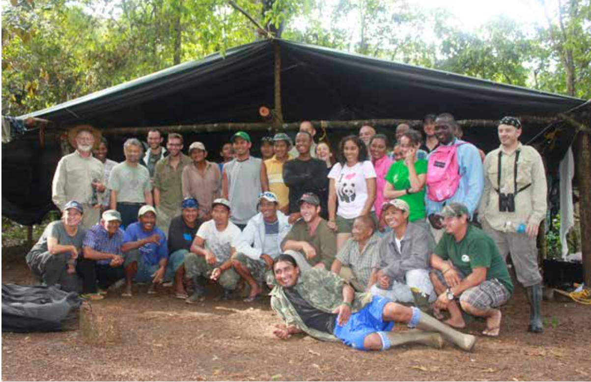
The Southern Rupununi Biodiversity Survey Team / © WWF - GWC.