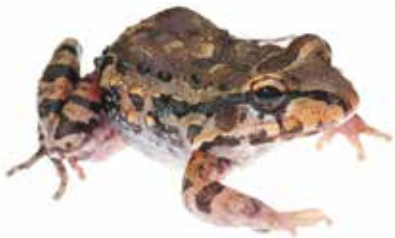
Myer's thin-toed frog ( Leptodactylus myersi ). This species was officially recorded for the first time in Guyana during this survey (photo on the left).

The amphibian fauna of the southern Rupununi savannah includes frogs and toads. Twenty-seven species were found during our survey but there are certainly many more that are present in the area. Their life cycle depends on both water and land, making them excellent indicators of ecosystem health. Clean, unpolluted water is needed for the complete development of their larval stages and adults are sensitive to land use changes that degrade wetland and forest habitat used for breeding.