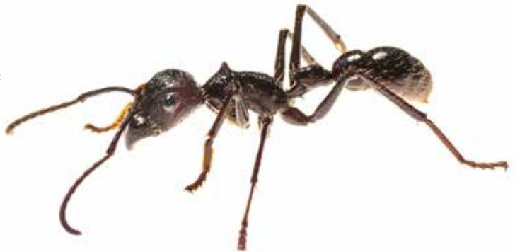
Bullet ants ( Paraponera clavata ) reputedly have the world's most painful insect sting. This massive ant requires fairly large blocks of rainforest as habitat.