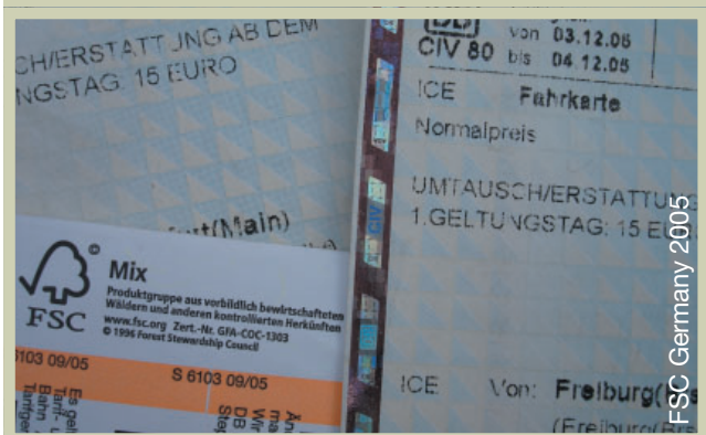
FSC Germany 2005