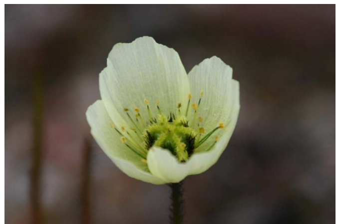
Svalbard poppy ( Papaver dahlianum )

Insect pollination is one of the results of evolution and long-term coexistence between insects and plants. Some of these symbiotic relationships are very strong and thus particularly vulnerable to climate change. For example, a warmer climate could result in earlier flowering, without the life cycle of the insects on which the plants are dependent undergoing a similar shift.