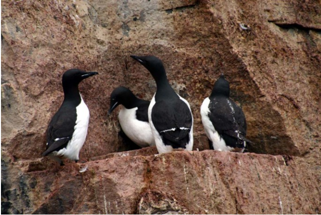
Common guillemots ( Uria aalge ) on Bird Mountain in Svalbard, Norway.

It is difficult to predict what will happen to birds. The main reason for this is that few birds stay in the Arctic for longer than three months per year. Their living conditions depend on what happens elsewhere. However, it is likely that the climatic changes underway in the Arctic will not exceed the adjustment capacity of the birds that nest there. Earlier snow-melting and increased summer temperatures will be beneficial for successful nesting.