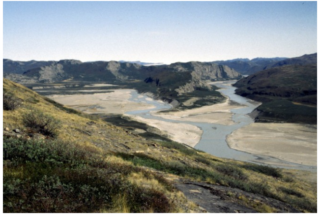
Arctic landscape and glacier rivers

The dominant plant species that constitute arctic vegetation are very different from most other types of vegetation (apart from alpine vegetation) because these species are able to carry out their metabolic and reproductive processes just above or below 0°C. Permafrost levels in the Arctic have existed for thousands of years, covered by just a thin, active layer of soil that thaws every summer. Access to nutrients is limited due to the low temperatures and the thin layer of soil. Arctic plant species have adapted their access to nutrients and their growth to this thin but relatively constant soil. Climate change can alter several of the environmental factors to which arctic plant species have become adapted. An extended growth season, earlier snow-melting, altered precipitation patterns, deeper layers of soil and increased mineralisation and decomposition rates will all affect the productivity responses and phenological development of these plants.