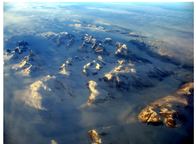
Inland ice and glacier arms protruding into the sea

Arctic ecosystems are highly restricted by low temperatures and permafrost. Huge quantities of carbon have accumulated in the soil in the form of frozen or buried organic deposits. Scientists believe that these layers of organic materials are a potential source of major emissions of the greenhouse gases carbon dioxide (CO_2) and methane (CH_4) . If the permafrost melts, these organic materials will break down more rapidly and there will be dramatic increases in emissions of carbon dioxide and methane. This is one example of a so-called "positive feedback effect" where a warmer climate leads to increased emissions of greenhouse gases, further reinforcing the greenhouse effect. Arctic warming has already resulted in an increase in net emissions of carbon dioxide and methane and is contributing to increasing atmospheric concentrations of carbon.