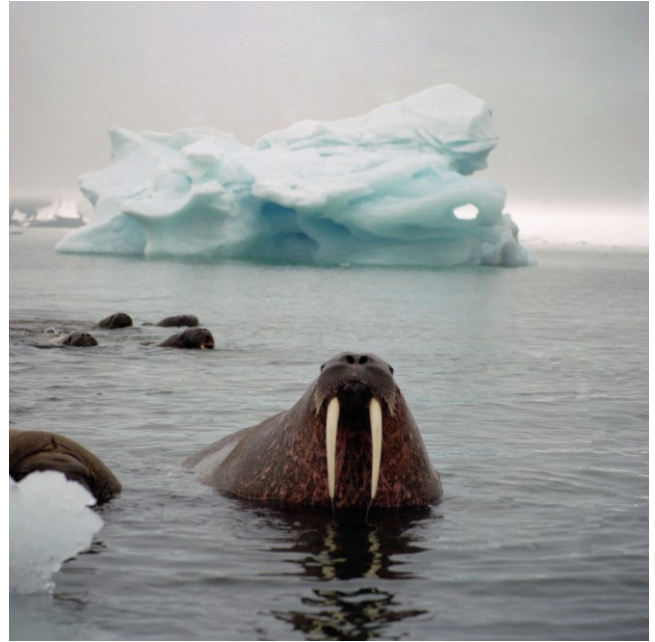
Walrus ( Odobenus rosmarus ), Svalbard, Norway.

Attempts during recent years to chart environmental toxins have revealed high levels of toxicity in arctic sea mammals. These toxins are stored in the fatty tissue and are transferred from small animal plankton to fish and then onwards to sea mammals and sea birds. Environmental toxins affect the reproductive abilities of animals. Recent research shows that climate change can potentially alter the transport of pollution to polar areas and exert an even greater burden in the form of environmental toxins on the arctic ecosystem. As climate change warms arctic waters, higher temperatures can increase the uptake of toxins in marine organisms.