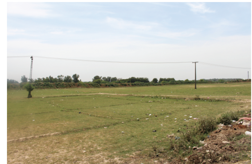
Plate 3: Proposed site for small water reservoir

There is tangible evidence that the overall water situation in the country is deteriorating both, in terms of quality and quantity. Sialkot is no less than an economic hub and a significantly populated city. In order to retain its industrial productivity and to meet the needs of its growing population, Sialkot needs to understand and address its water issues through the aforementioned recommendations.