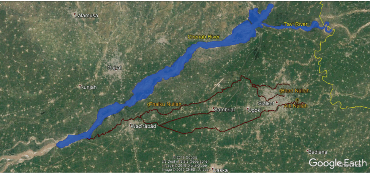
Fig. 3: Map of nullahs that drain into River Chenab