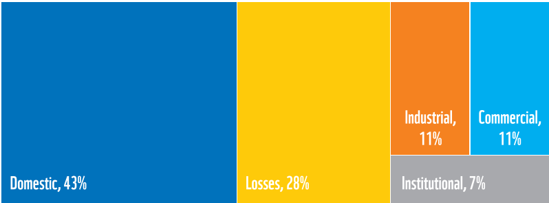
Fig. 1: Water Use in Sialkot