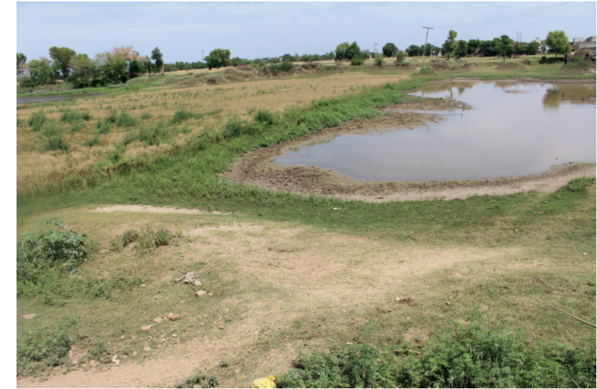
Plate 2: Proposed site for rainwater harvesting and water recharge zone