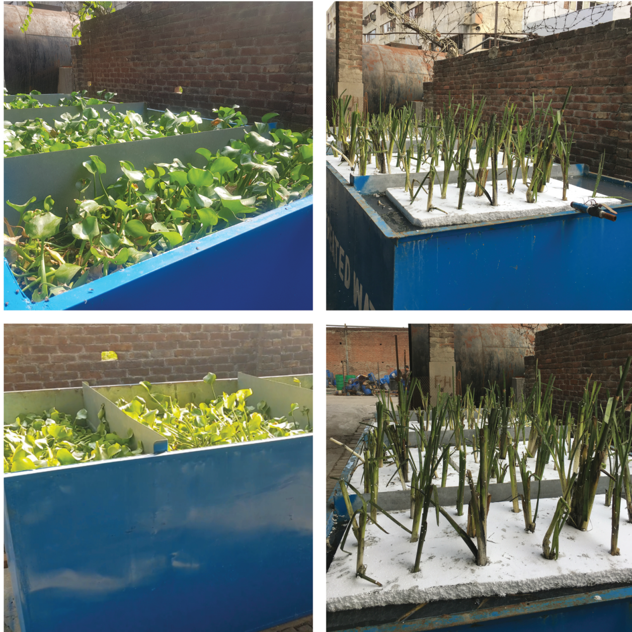
Plate 1: Bio-remediation pilot for chrome tanning wastewater