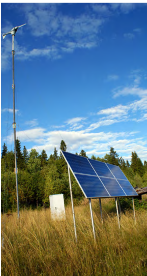
A solar panel in the Vodlozerskiy national park, Karelia region, Russian Federation.

Shifting to renewable energy offers co-benefits that are crucial to success in several SDG goal areas. These include reducing outdoor and indoor air pollution, which will improve health outcomes and lower the incidence of respiratory disease. This is particularly pertinent to women and children's health in poorer countries. Provision of more sustainable and efficient