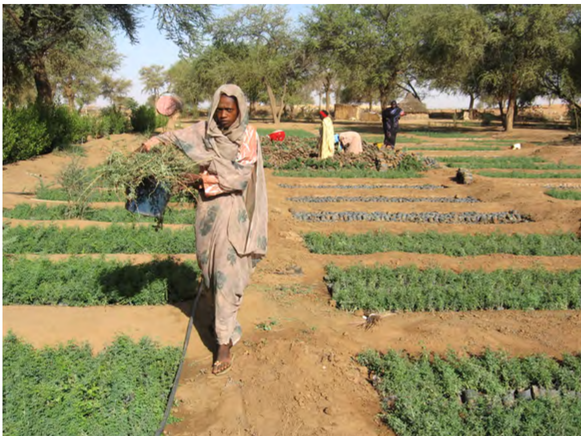
A woman working in a tree nursery in Northern Darfur, Sudan - an area affected by conflict and drought. The nursery is part of a natural resource management project.

However, the multiple impacts that climate change can have on the poor and most vulnerable will increase up to and beyond 2030 unless ambitious action to reduce climate risk and vulnerability is taken across all goal areas. Beyond 2030, the scale of the impacts will be determined by whether global emissions cuts happen at a speed and scale fast enough to avoid further temperature rises (see the 'Low carbon development' section, below).