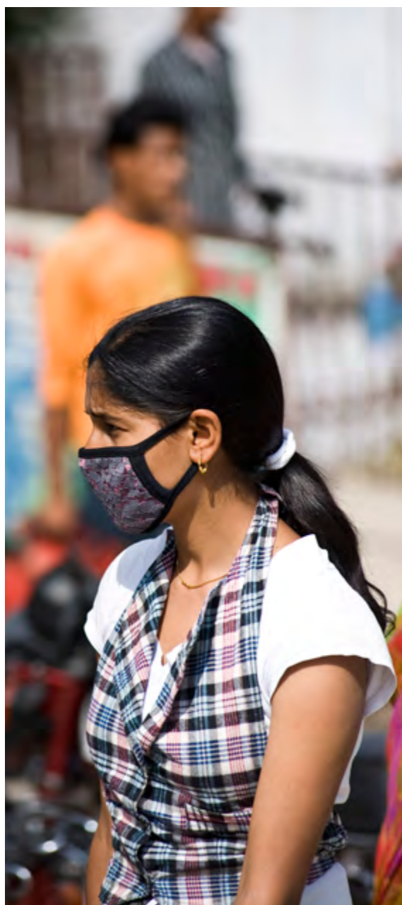
Pollution is a serious problem in Kathmandu, Nepal. The city lies in a valley and pollution often hangs over the city, affecting the population.

The framework should support substantially reducing water-related vulnerability to climate change, because it puts goals on poverty, health, economic growth, and potentially peace and security, at risk.