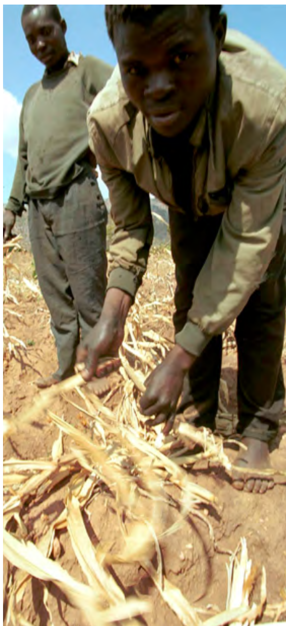
In Malawi, farmers from Nkana Khoti Village show their destroyed maize crop. Severe drought in the region leads to malnutrition and widespread hunger.

impacts already 'locked-in' by past emissions, will depend on the development pathways that countries take now. There is increased need to address the loss and damage that emission mitigation and adaptation measures can no longer remedy. Critically for the SDGs, global development over the next 15 years is likely to determine whether we can cut emissions fast enough to avoid catastrophic climate change later this century. Urgent action is required to achieve a peak and decline of emissions before 2020.