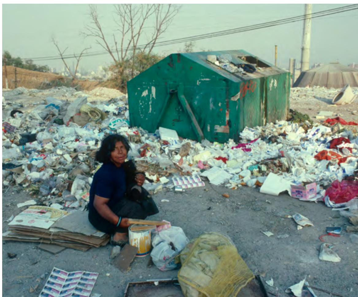
A small refuse tip at Polvora, on the west fringe of Mexico City, Mexico.

The OWG's proposed Goal 12 – to 'ensure sustainable consumption and production patterns' – needs to expressly address the role that unsustainable consumption and production in richer societies plays in driving climate change, which impacts most on poor and vulnerable groups.