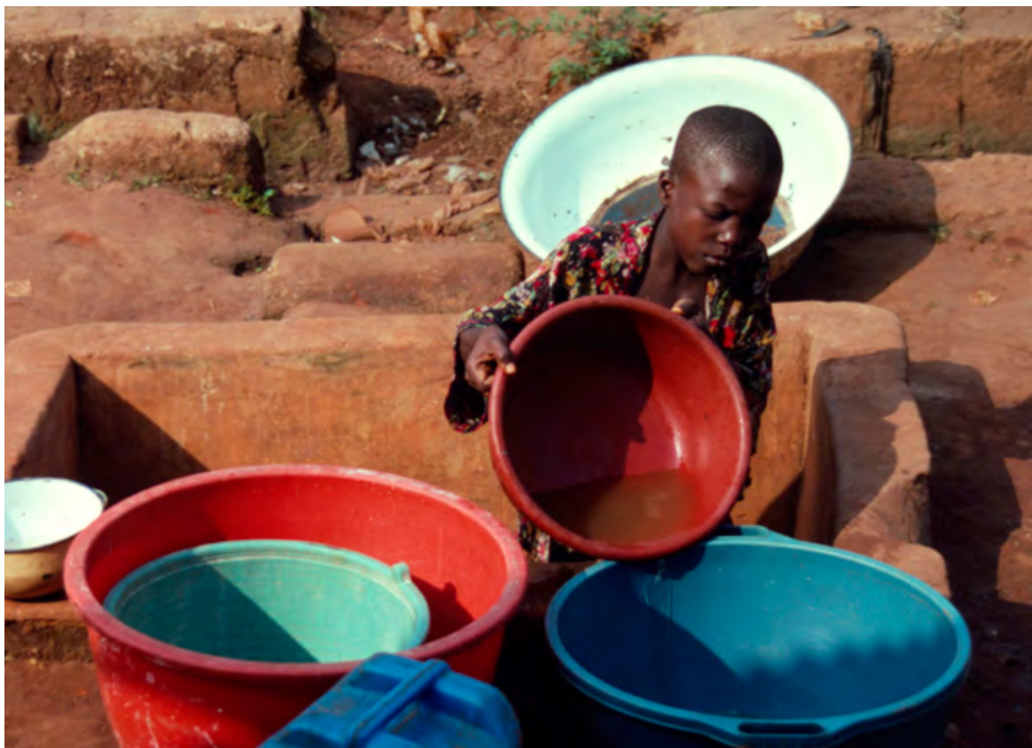
Water scarcity and lack of access to clean drinking water are common problems in Benin City and other urban centres in Nigeria.

Sea-level rises and more frequent and intense storms are increasing flood risk. They are projected to cause rising flood losses in the global South, and resettlements are already planned for some African and Asian river deltas. The potential scale of displacement, however, is beyond the capacities of many countries to adapt: small island states may become uninhabitable, while India and Indonesia are projected to experience an 80% and 60% increase, respectively, in the number of people