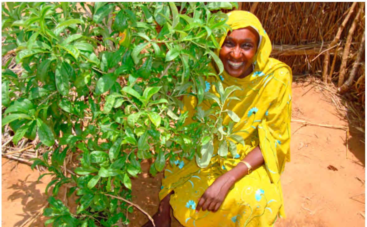
A member of the Darfur Women's Development Association with a sapling for the 'greening Darfur' project.

The Working Group III report outlines options for reducing GHG emissions and the likely impact of these. GHG emissions have been growing in almost all sectors over the last decade and are still on an upward path. While population growth has contributed to this, economic growth has been a much bigger driver. Emissions growth has outpaced improvements in energy intensity and, in recent years, increased use of coal has reversed a long-term trend towards decarbonising the world's energy supply. About half the emissions growth has come from the energy-supply sector, but industry (30%) and transport (11%) are also major contributors.