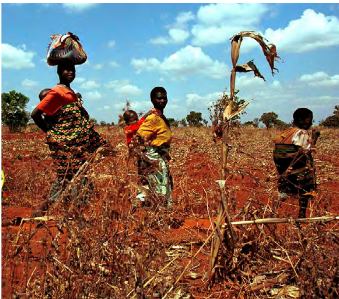
Women farmers walk through dry, barren fields, past remnants of their failed crops. This area of Malawi, although extremely poor, had been self-sufficient with food. Now communities suffer from malnutrition.

The Proposed SDGs from the OWG on terrestrial ecosystems (Goal 15) and on food security and agriculture (Goal 2) should tackle the impacts of forest degradation and agricultural practices on GHG emissions. When they are implemented well, activities to reduce deforestation can achieve co-benefits for several SDG areas, for example conserving biodiversity and water resources. Targets on agriculture should recognise how to reduce the sector's emissions through agro-ecological practices. Linked to SCP, demand-side measures such as diet changes and reducing losses in the food supply chain can also reduce emissions from food production.